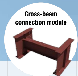
Cross-beam connection module